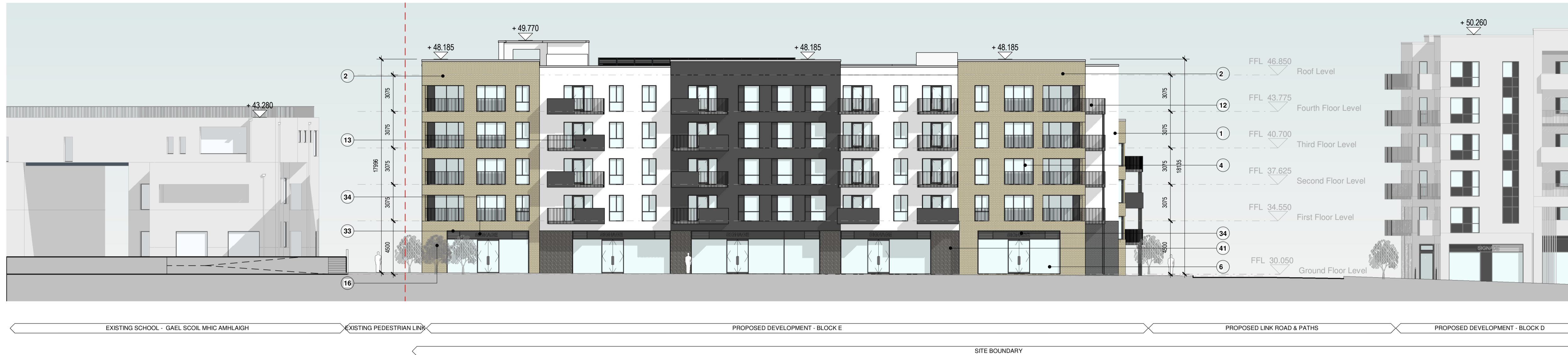
1 BLOCK E - WEST FACADE ALONG EXISTING ROAD 1 : 200