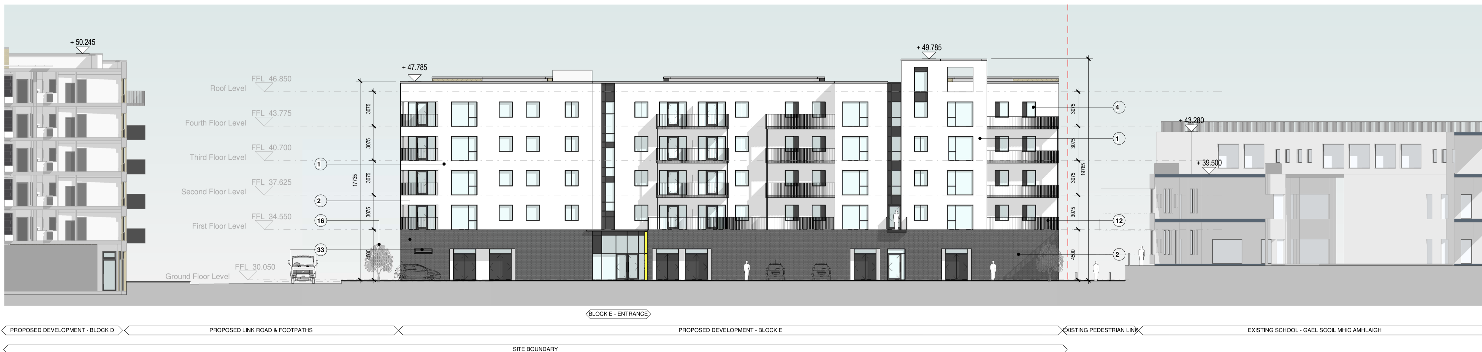
2 BLOCK E - EAST FACADE 1 : 200